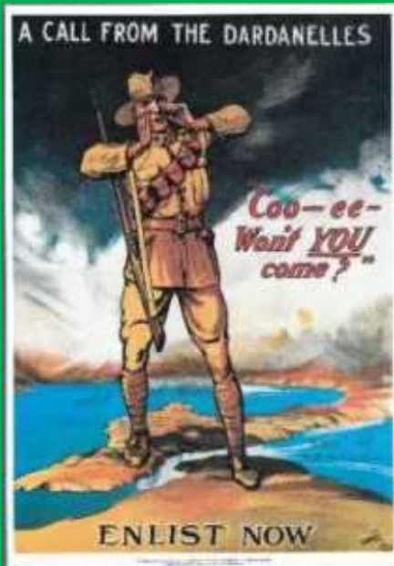
WW1 Recruitment poster.