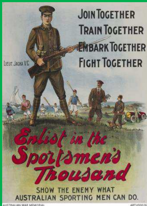
WW1 recruitment poster depicting Lieut. Albert Jacka VC