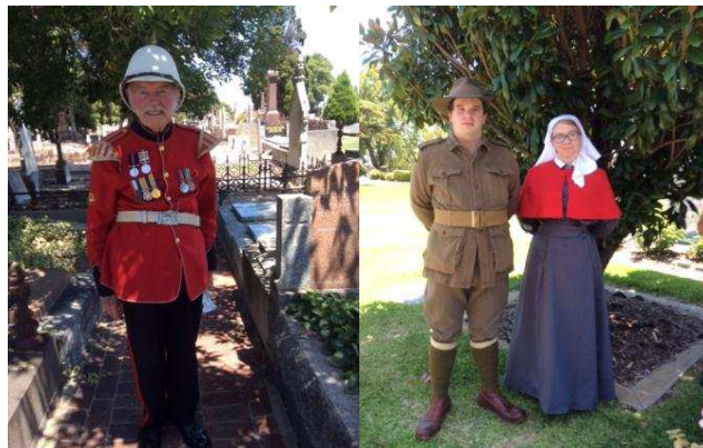
Photo: Some wonderful costumes at Albert Jacka Commemoration Service, Sunday 17 January 2016, held at St Kilda Cemetery