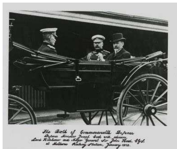
The Birth of Commonwealth Defence, Defence Minister Joseph Cook with advisers, Lord Kitchener and Major General Sir John Hoad, CGS, at Melbourne Railway Station, January 1910