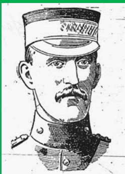
Colonel John Charles Hoad. Boer War illustration

Image Hoad portrait: The Commonwealth Military Journal 1911-1914